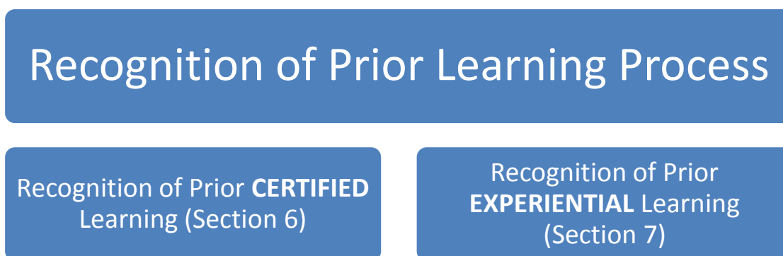
Figure 1 Recognition of Prior Learning

Recognition of Prior EXPERIENTIAL Learning (RPEL) process (See Section 2.6 for definition and Section 7 for process)