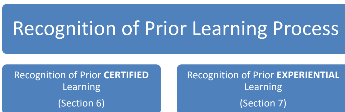
Figure 1 Recognition of Prior Learning

Recognition of Prior EXPERIENTIAL Learning (RPEL) process (See Section 2.6 for definition and Section 7 for process)